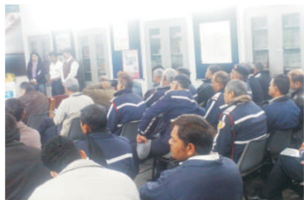
Driving skills for life - Training Programme for Delhi Traffic Police officials