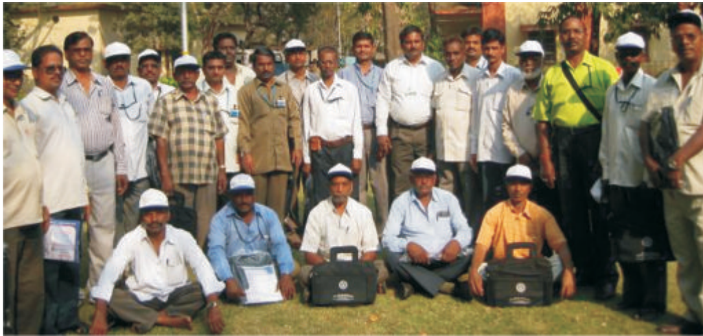
Group of drivers at Training Programme for DRDO drivers