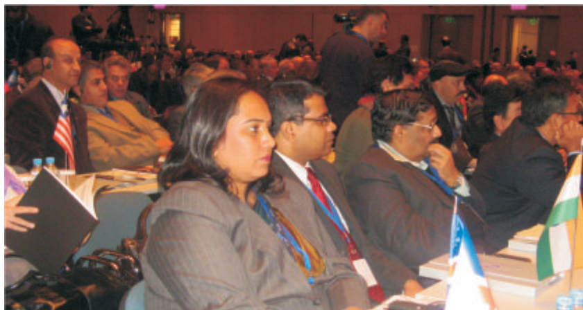
Representatives from India at Moscow Conference

The outcome of the conference was a determined bid to ensure that each country adopts an effective road safety policy which should be made keeping the following in mind: