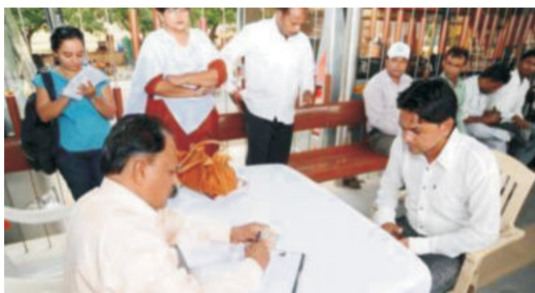
Faculty doing assessment of drivers