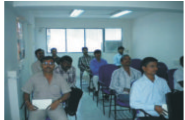
Road Safety activities organized by SIAM-SAFE members during National Road Safety Week 2010