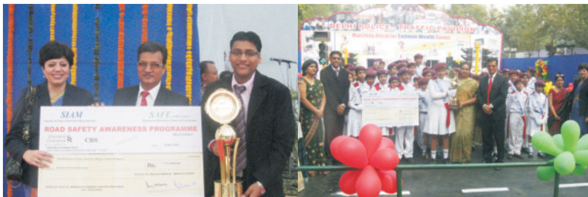
Road Safety Rolling Trophy presented to Bal Bhavan Public School, Mayur Vihar, New Delhi