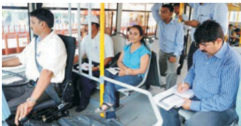
Faculty conducting assessment of driver while driving the vehicle