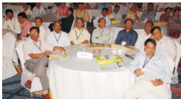
Participants at the SAFE Annual Convention 2009