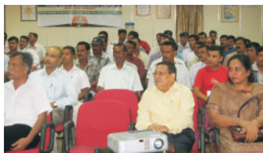
Drivers attending the two day training programme on Defensive Driving and Road Safety at Guwahati