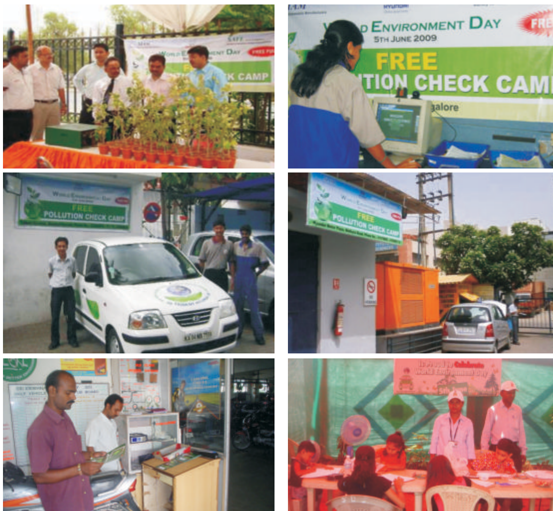
Glimpse of the PUC Checking Campaign by SIAM members on 5 th June 2009