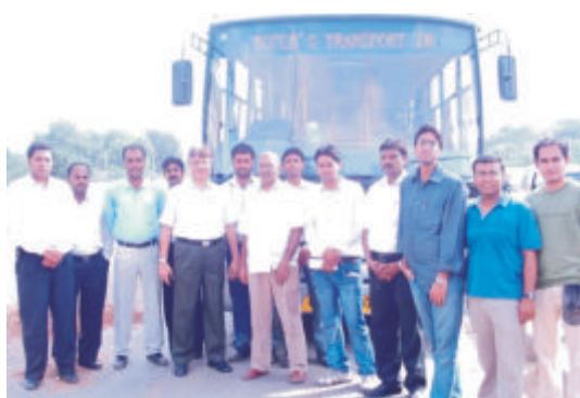
Team of BRT Ahmedabad with drivers

SAFE provided assistance in organizing a week long driver training programme for Bus Rapid Transport (BRT) drivers at Ahmedabad. The programme consisted of pre- and post-practical training and detailed theory classes on road safety and defensive driving. After completion of the training programme, an assessment was also conducted for the drivers and the result shared with Centre for Environmental Planning & Technology University (CEPT) officials.