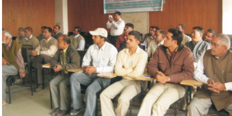
DTC trainers at the training programme on Soft Skills Development

52 DTC trainers were trained in two batches which started in December 2009 and concluded in January 2010. On 26 th March 2010, they received certificates from the Ministry of Labour.