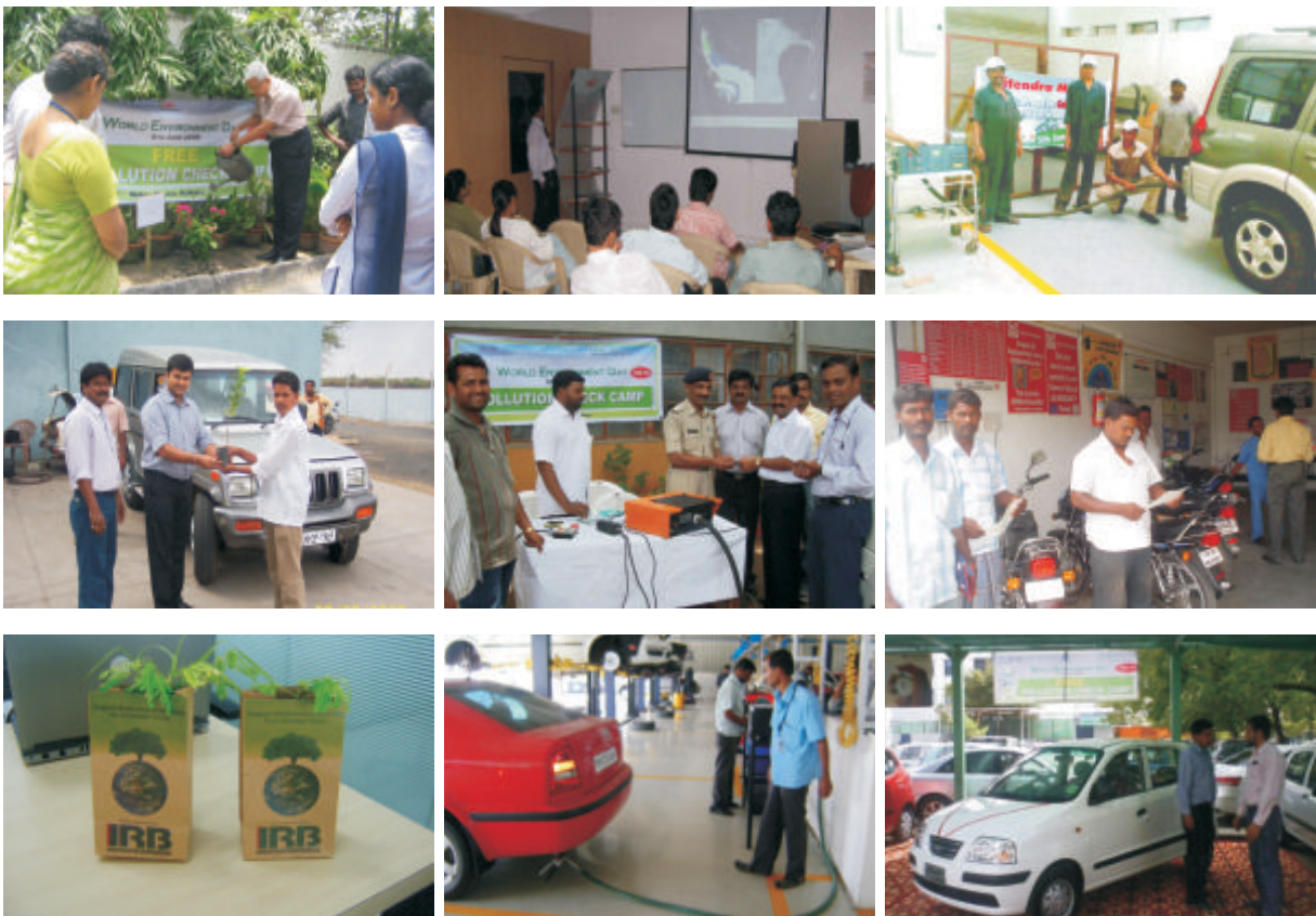
Glimpse of the PUC Checking Campaign by SIAM members on 5 th June 2009

On this day, SAFE, in partnership with its members, conducted 'Free Pollution Check Campaign' all over the country and issued free PUC (Pollution Under Control) Certificates to the customers whose vehicles met the prevalent emission limits. 2200 PUC check-up camps were set up in 256 cities across the nation with an aim to check more than 50,000 vehicles. In 2008, SIAM- SAFE had set up PUC check-up camps at 1200 dealerships covering more than 250 cities across the nation checking 25,000 vehicles.