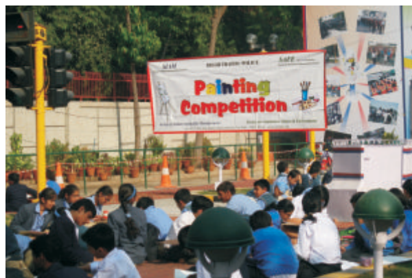
Road Safety painting competition organized at Pragati Maidan, New Delhi

SIAM-SAFE, with the support from Delhi Traffic Police, organized a painting competition for school children during the fair. Over 600 students participated in the painting competition. SIAM sponsored all the prizes which were distributed during National Road Safety week in January 2010.