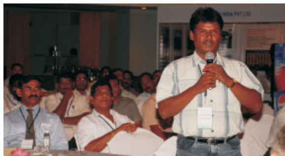
Participants interacting with speakers during question and answer session