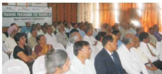
DTC staff and trainers at the inauguration of training programme for DTC trainers