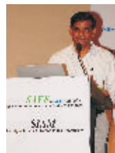
Mr. S. Machendranathan Transport Commissioner, Government of Tamil Nadu