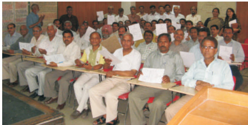
Distribution of certificates from Ministry of Labour and Employment, Government of India, to DTC trainers