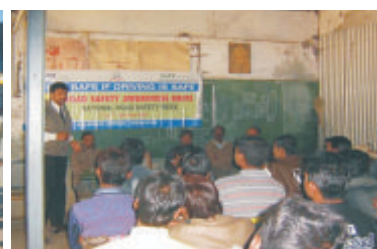
Road Safety activities organized by SIAM-SAFE members during National Road Safety Week 2010