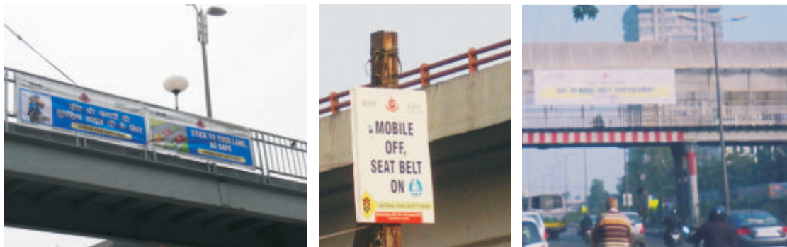
Display of 1500 banners and Kiosks in New Delhi